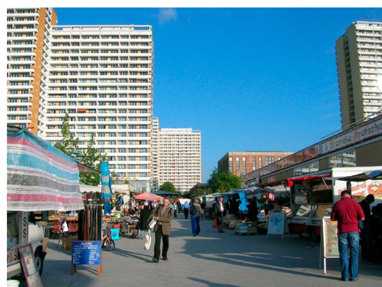
Weekly Market