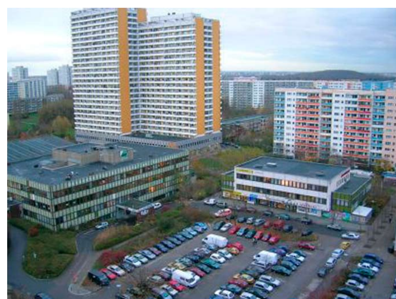
View from a 14th floor

A number of different milieus can be found in the central settlement and in the marginal villages, as is to be expected, the latter tending towards middle class milieus.