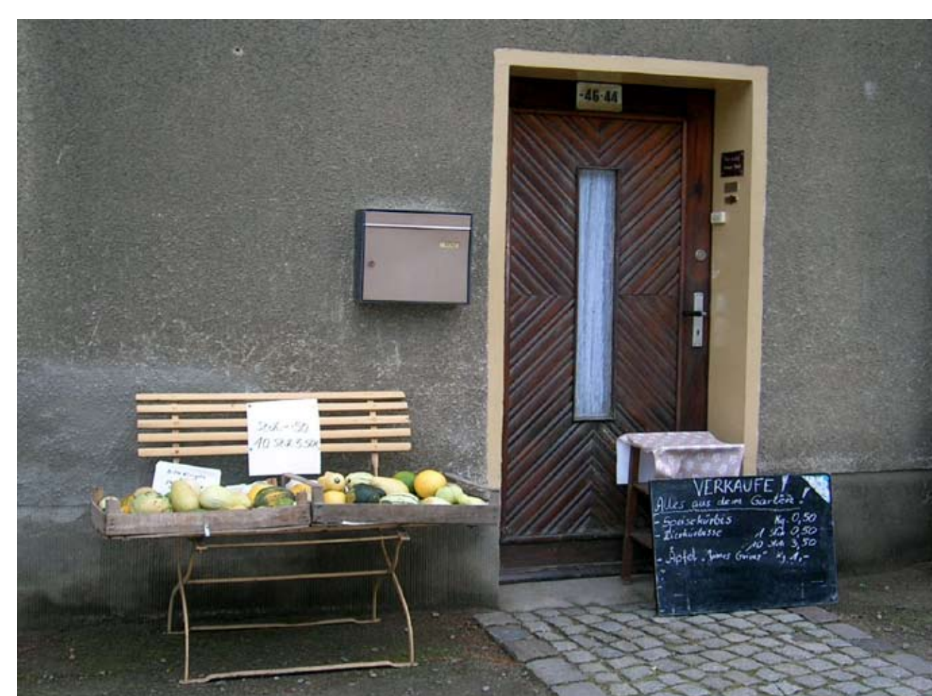
Invention of tradition - Thanksgiving