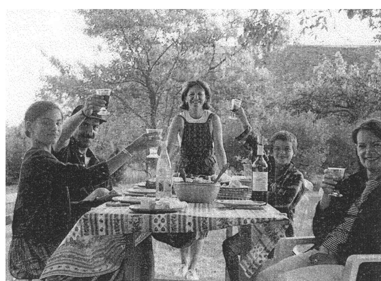
In the family home, during the vacations, pictures are shot to keep track of happy moments (Source: Martyne Perrot 1998 "La maison de famille")