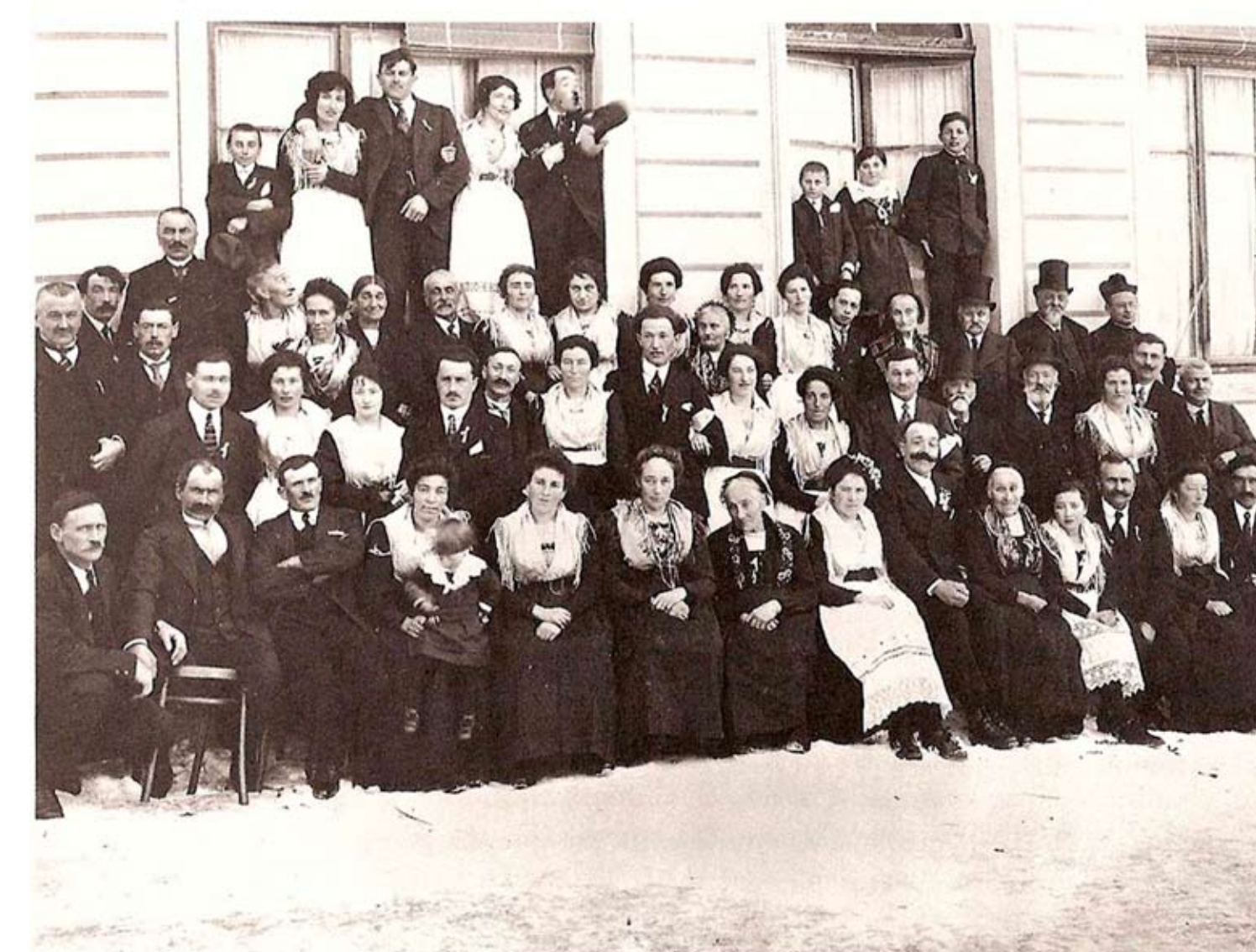
Wedding in an Italian mountain village, ca. 1920

Italy was characterised for centuries by a chequered geography of family forms and pronounced regional differences. "Three Italies" were still detectable around 1950: the proportion of people living in nuclear families was highest in the South, whereas in the cluster of central and north-eastern regions, where sharecropping had been both most widespread and most resilient, the weight of complex households was greatest;