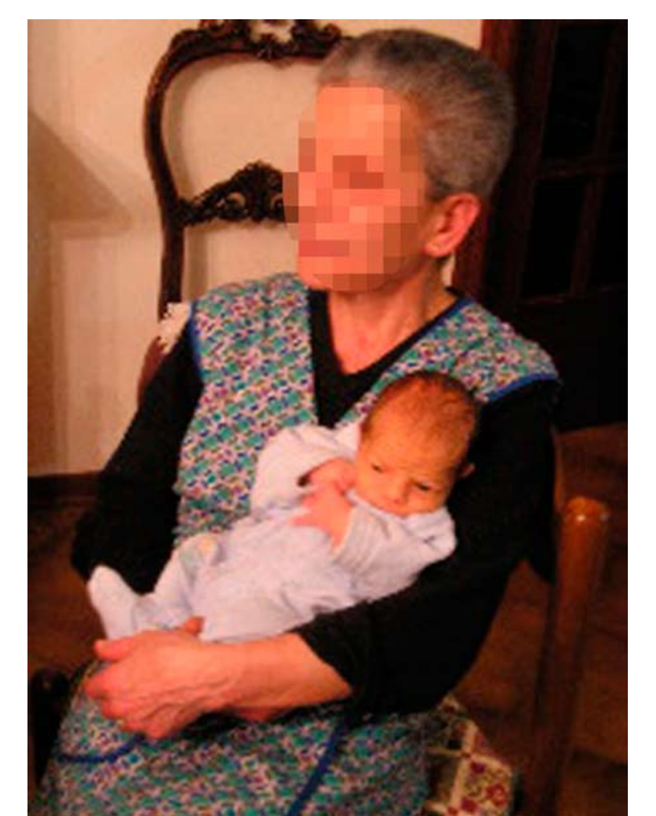
Intergenerational solidarity (Tuscany 2004)