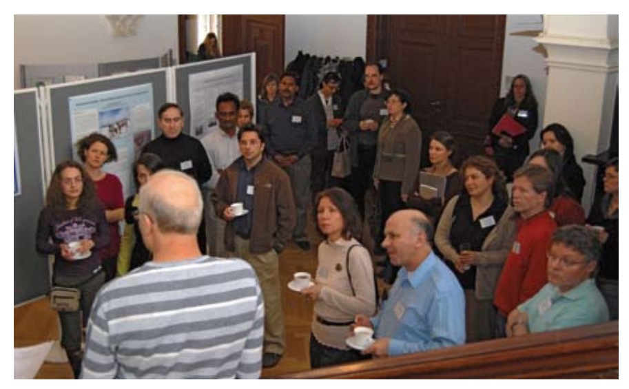
Conference 'Heading North, Heading South'