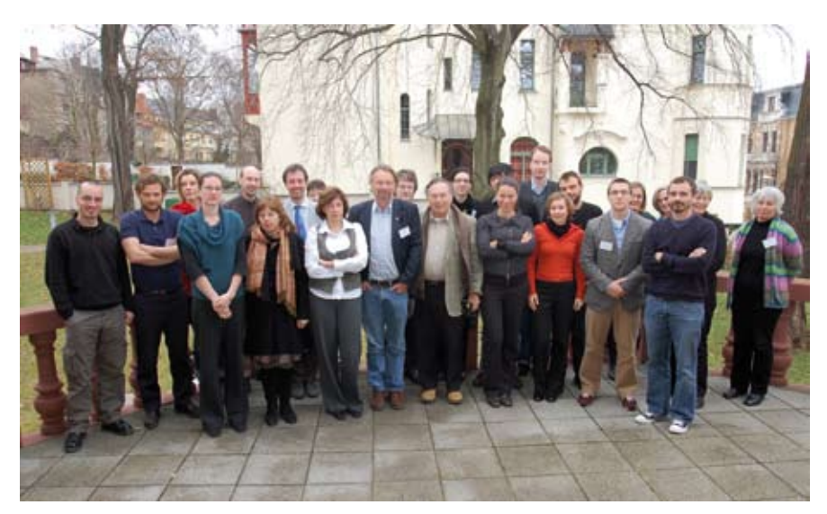
Workshop 'Emotion in Conflict'