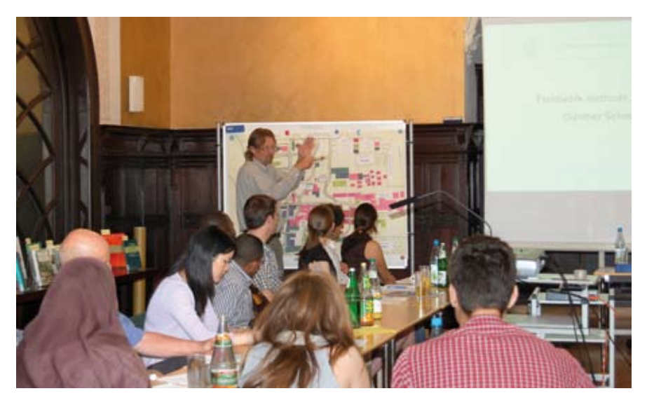
REMEP Training Course